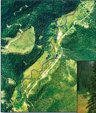
Figure 2. The Tepee Creek Meadows Restoration Project included reconstruction of stream meanders (blue) where the stream had been channelized (orange).