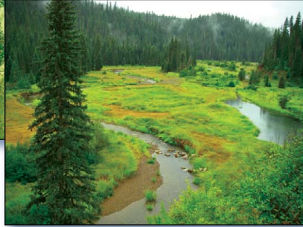
Figure 3. Middle Tepee Creek after reconstruction of meanders and revegetation, 2008.